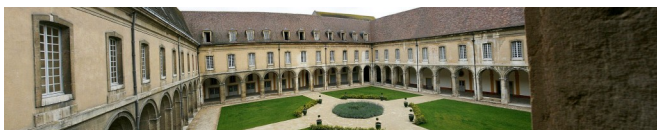
Conception graphique CCIC

The registration fees cover accomodation on the premises of the Cluny Abbey, working materials and all meals. Travel costs are not included in the fees.